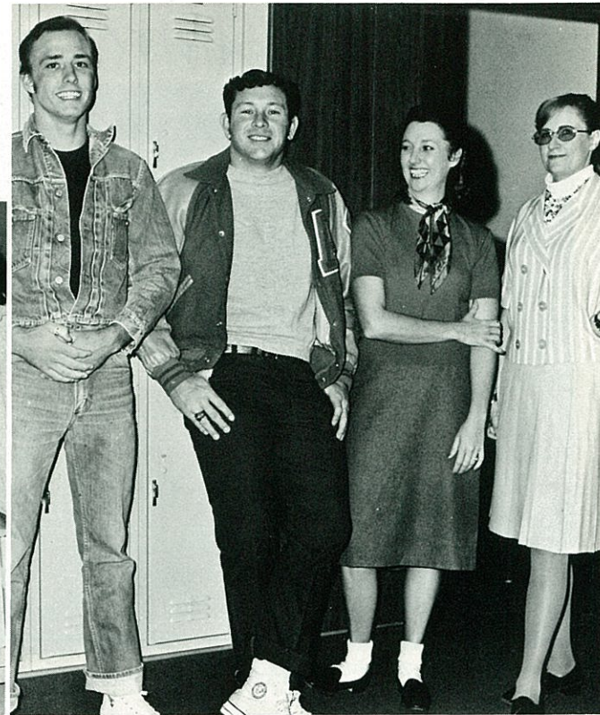
They've been brushing more often!