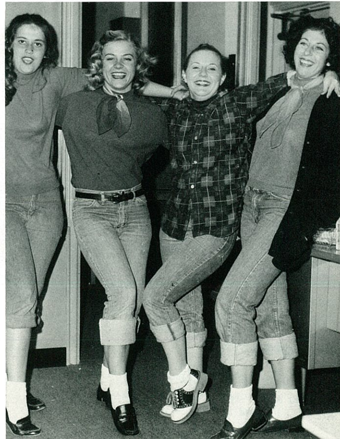
WHS chorus line.