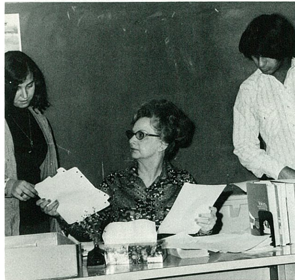
Now write it in English.