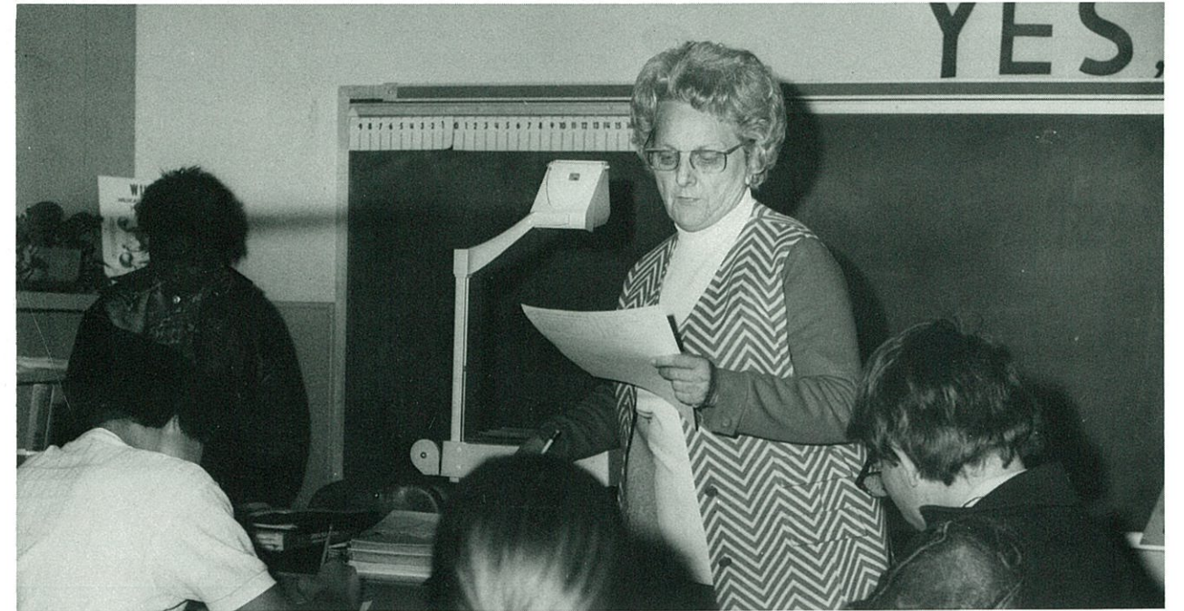
2+2 = 4, 2+3 = 5, -